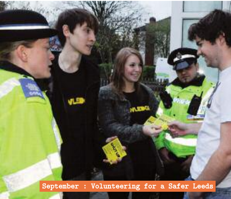
September : Volunteering for a Safer Leeds