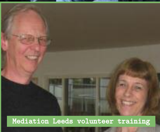
Mediation Leeds volunteer training

tion we work with Leeds City Council. The vast majority of the cases are disputes between tenants and landlords. We work with those parties to try to resolve whatever the dispute is. The idea being to try and keep the tenant within the tenancy.